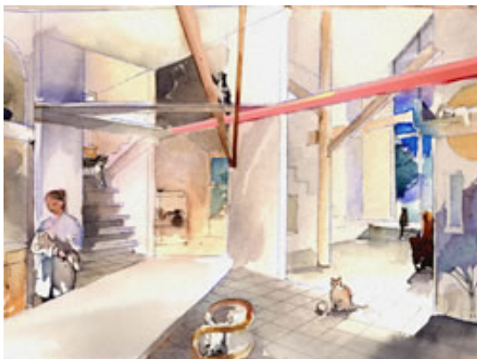
Cat House Interior