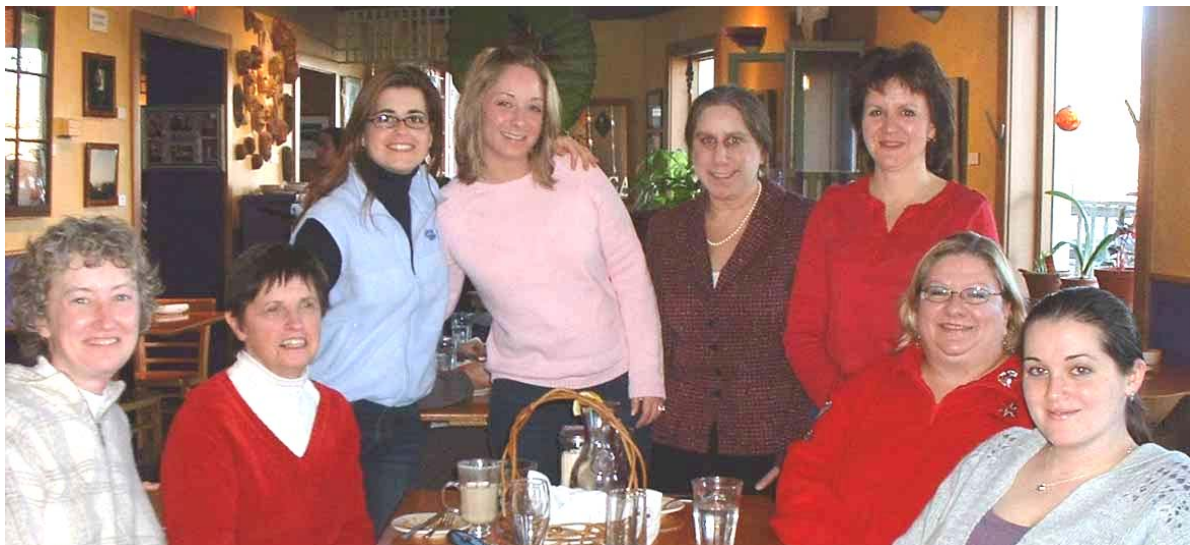
Members of Our Companions Animal Assistance Helpline volunteer staff.